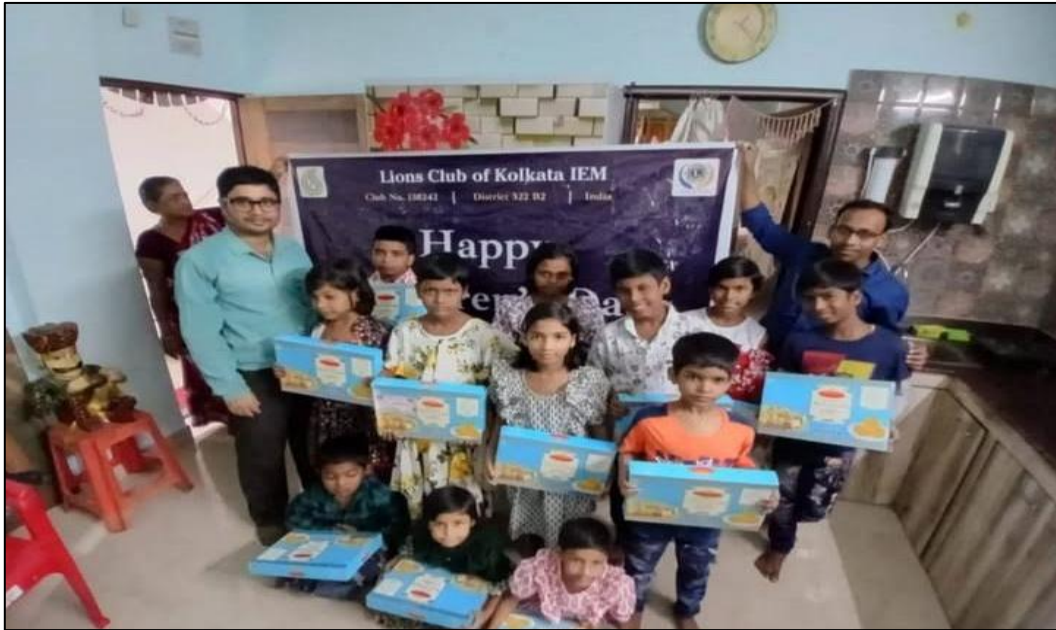
Joyful faces of children and faculties distributing gifts during the event "Icchepakha - Celebration of Children's Day with a heart!"