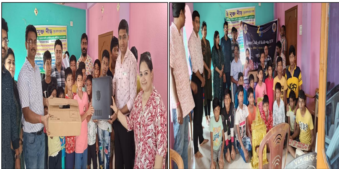
Dignitaries inaugurating the Vocational Computer Training Center at Contai