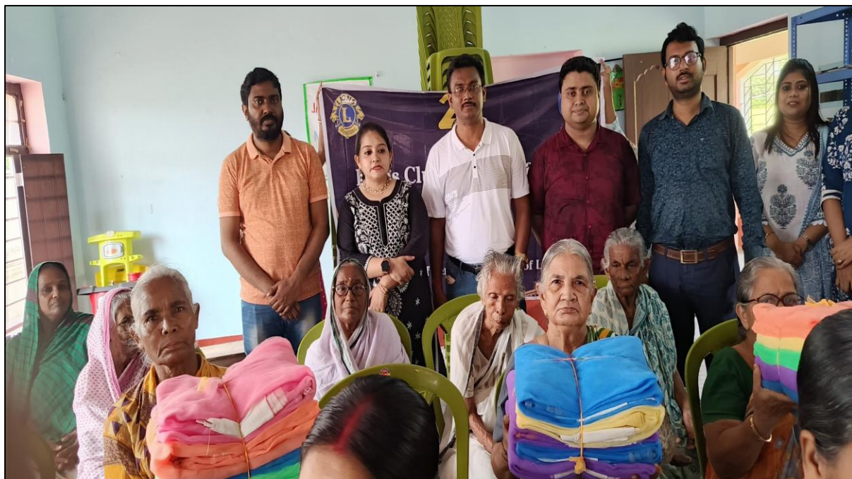
Club members distributing sewing machines and mosquito nets at the old age home