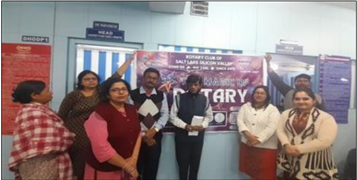
Providing donations for educational support