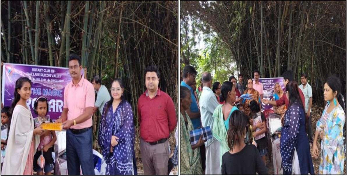
Providing donations in the event “Sharod Sahajogita”