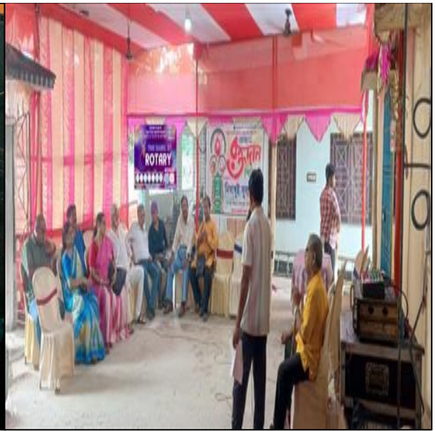
Blood donation camp at Duttapukur