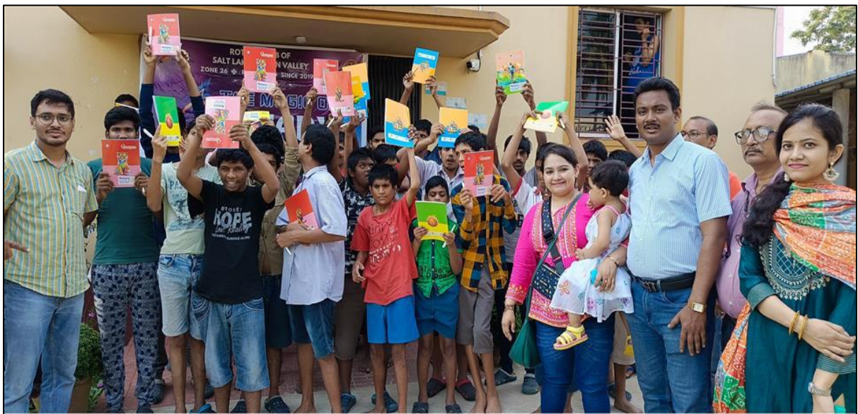
Providing donations in the event "Sahajogita"