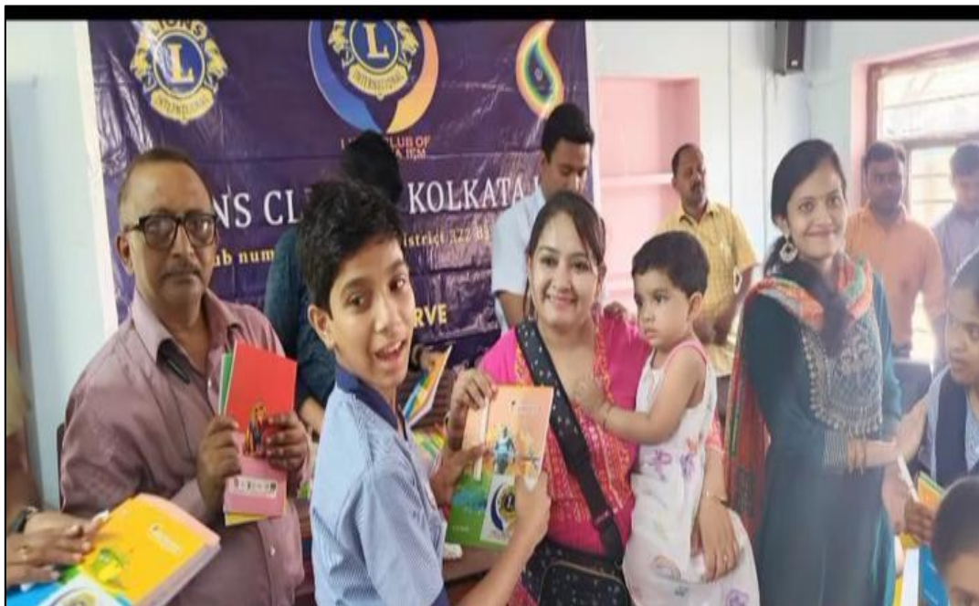
Joyful faces of children and faculties distributing gifts during the Faridpur outreach