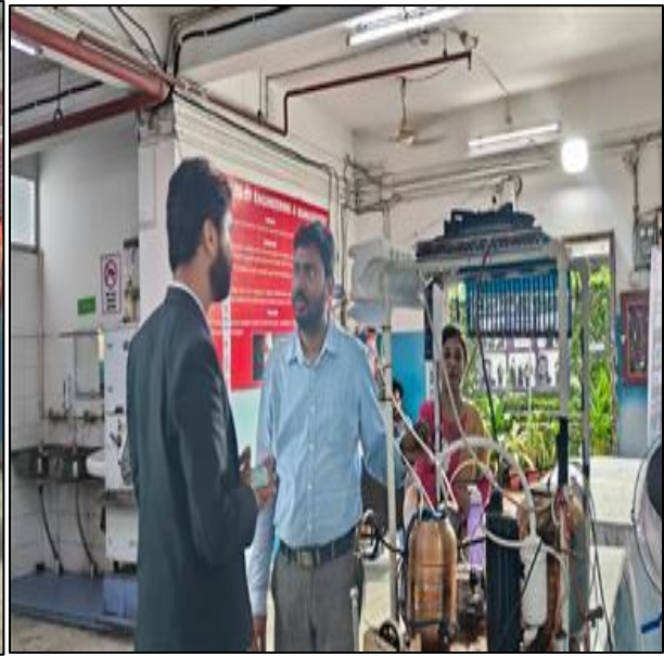
Students participate in “Pulseinnovate”: Project making on Health Care