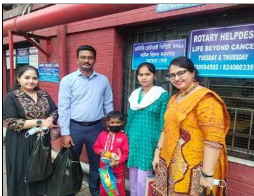
Providing support to cancer patients at SSKM Hospital