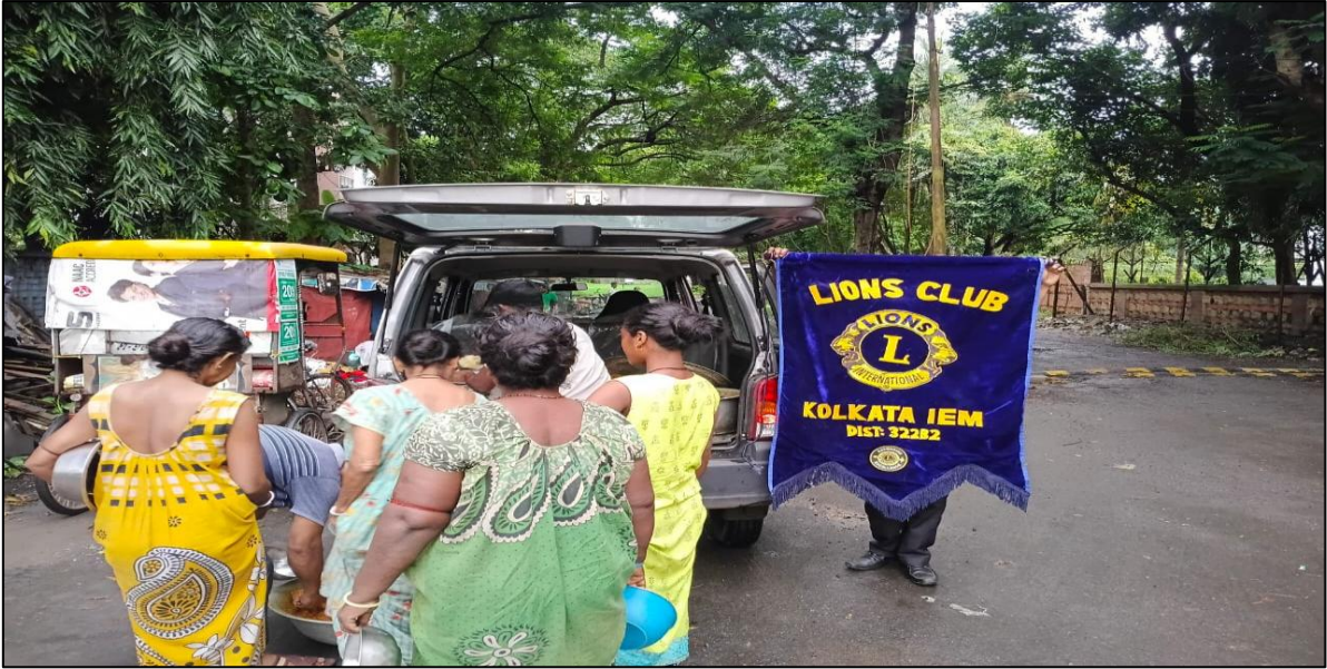
Cloth & Food Distribution at Duttapukur