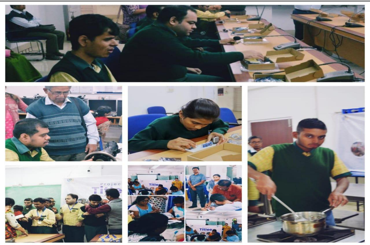
Empowering through skills: Underprivileged autistic students learning cooking and stitching, unlocking their potential