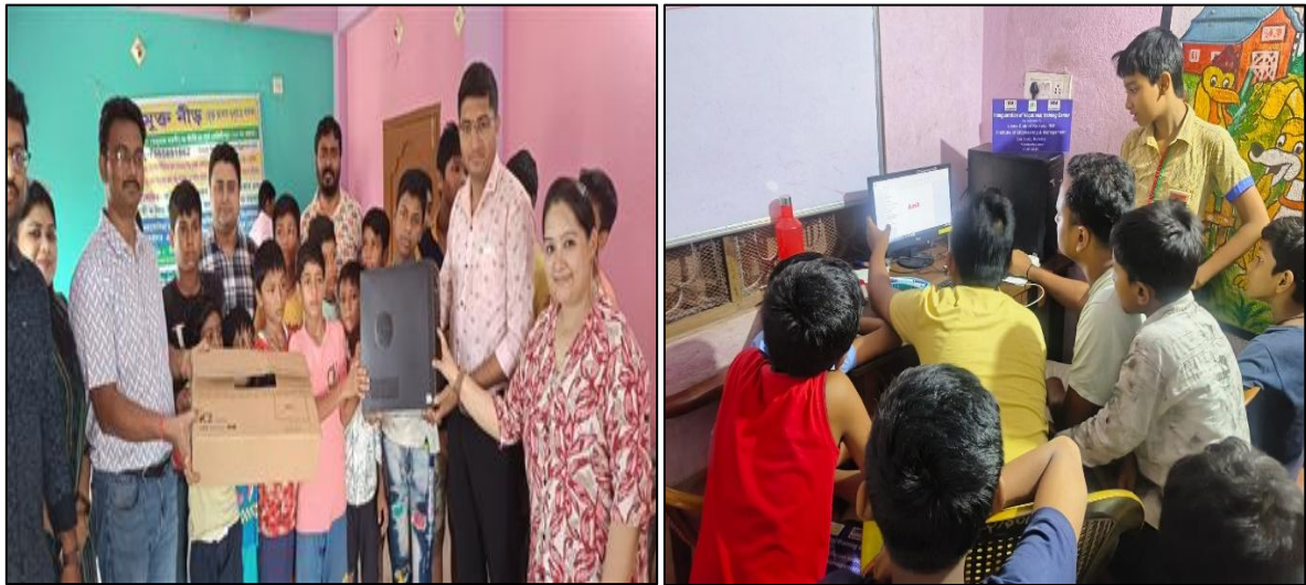
Distribution of computer as part of Computer literacy training