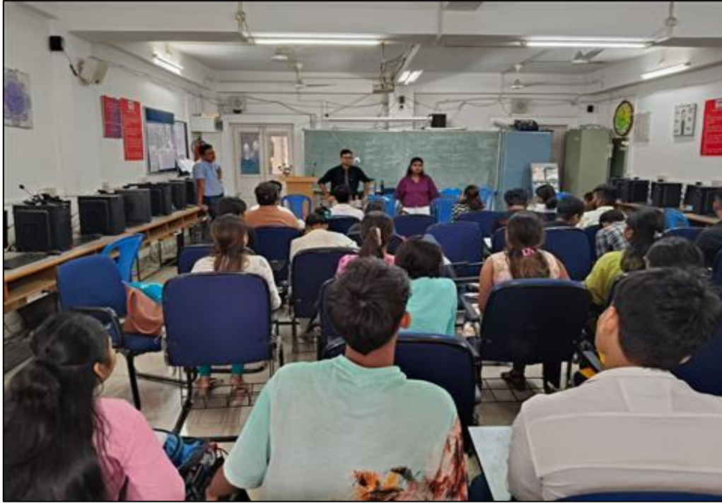
Vocational Service on Computer Literacy to the community