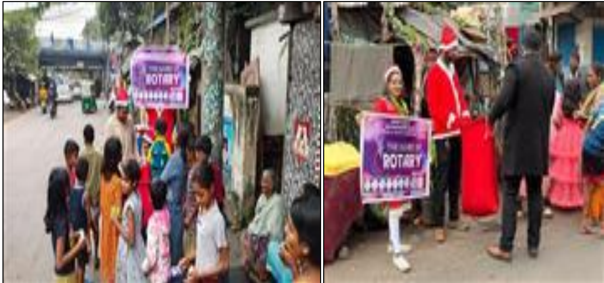
Christmas celebration with underprivileged