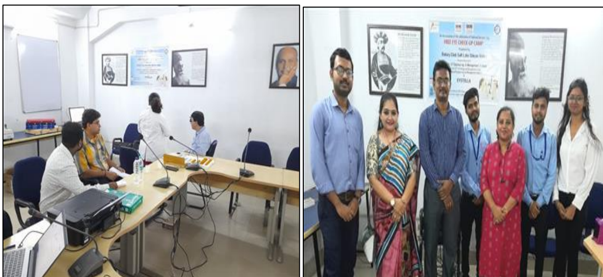
Free eye-check up camp at IEM