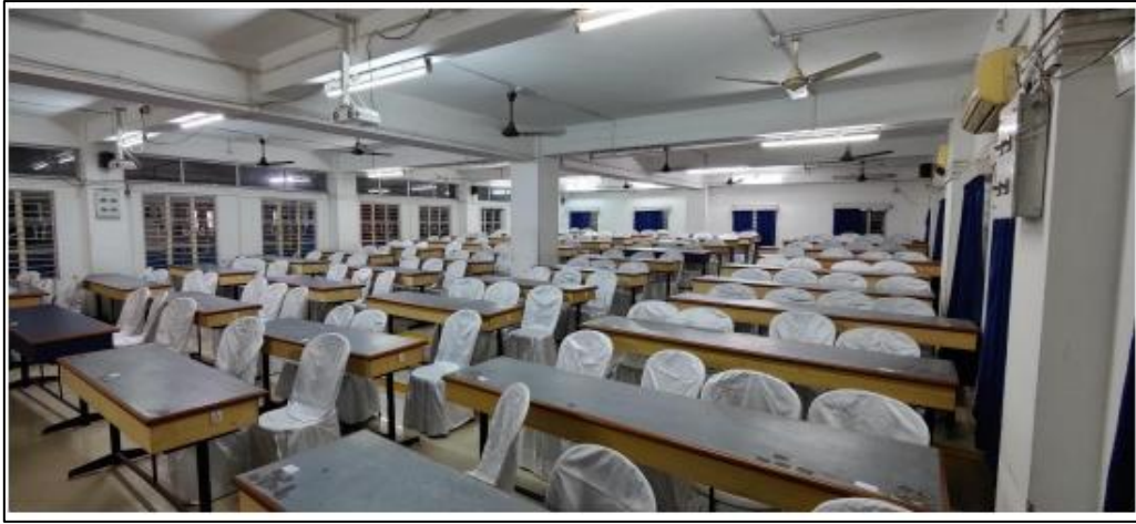
CCTV Cameras in all the classrooms