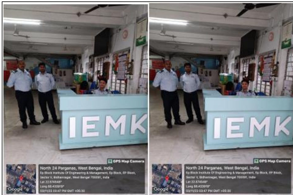
Security at front gate of IEM Salt Lake Campus