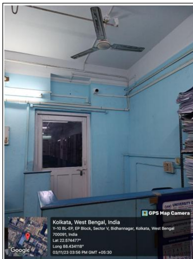
CCTV Cameras in Faculty Room