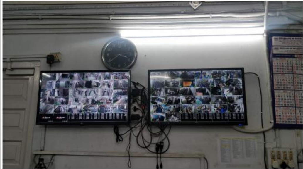
Campus Surveillance through CCTV Cameras