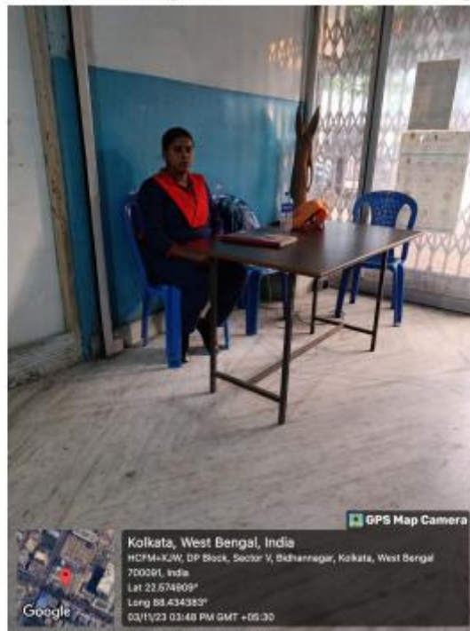
Security Personnel at the front gate of our Campuses